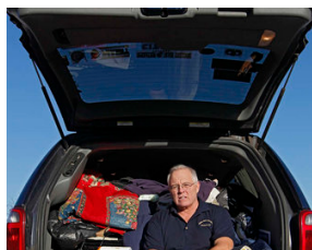
From the Pentagon to life in a van